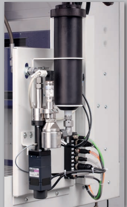
E-KDP 3 with cartridge