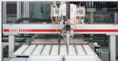
Dispensing robot DR-CNC with pallet conveyor system