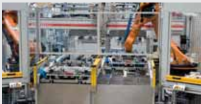
Dispensing robot DR-CNC with shuttle tables and automated part unloading