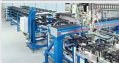
Dispensing robot DR-CNC with multi-level curing belt